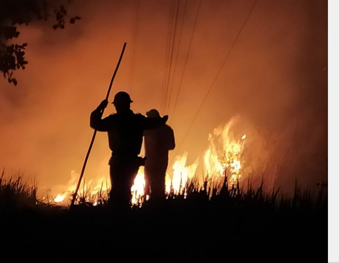
Equipment and salaries for fire brigades